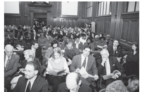
Attendees at “The Whole Tapestry Project in Milwaukee.” (above)